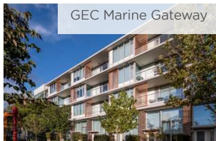
GEC Marine Gateway