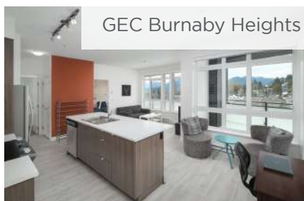
GEC Burnaby Heights