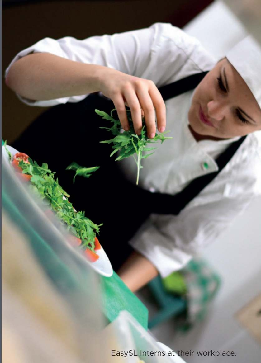
EasySL Interns at their workplace.