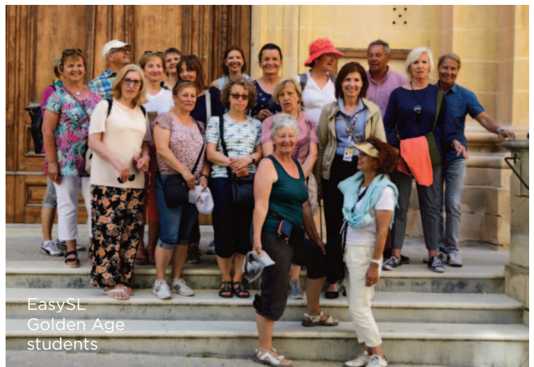
EasySL Golden Age students