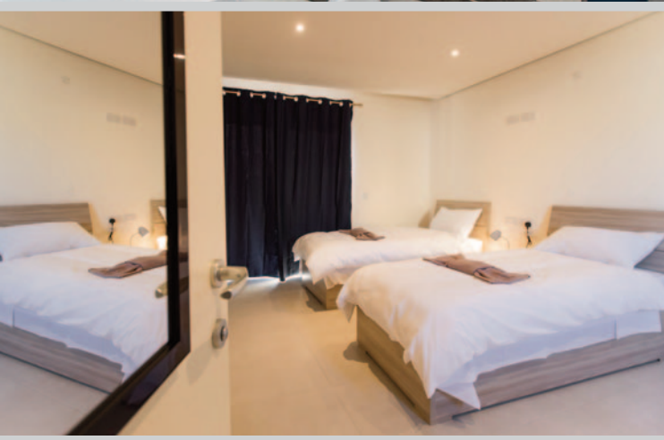
EasySL host family.

Your accommodation details will be sent to you 2 weeks prior to your arrival.