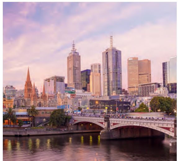
Photo: The historic Princes Bridge in Melbourne