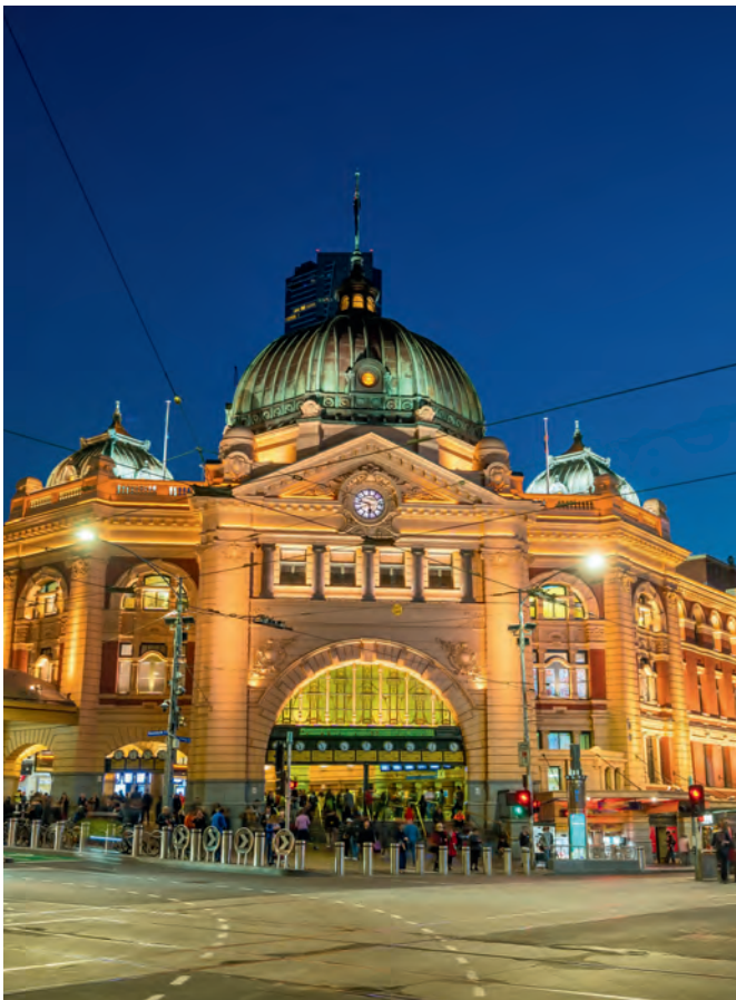
Photo: Melbourne's iconic Flinders Street Station