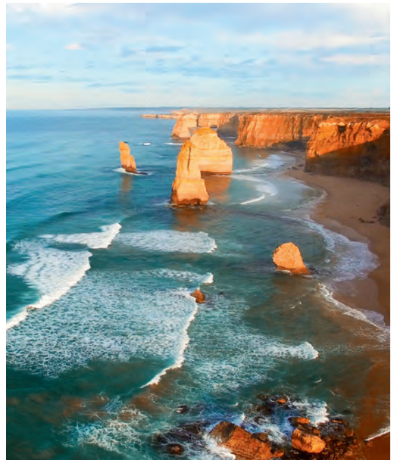
Photo: The Twelve Apostles, Great Ocean Road