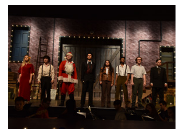
40+ STUDENT CLUBS | THEATRICAL EVENTS | LECTURES | VISITING POETS AND PROFESSORS | APPLETON MUSEUM OF ART