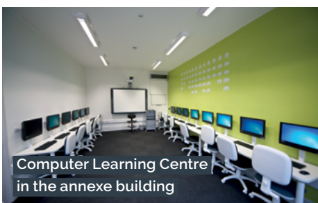
Computer Learning Centre in the annexe building