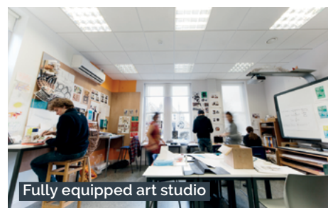
Fully equipped art studio