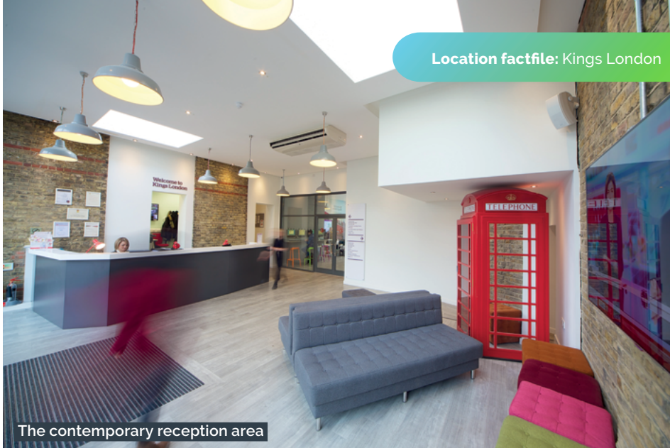
The contemporary reception area