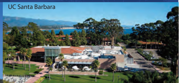
UC Santa Barbara