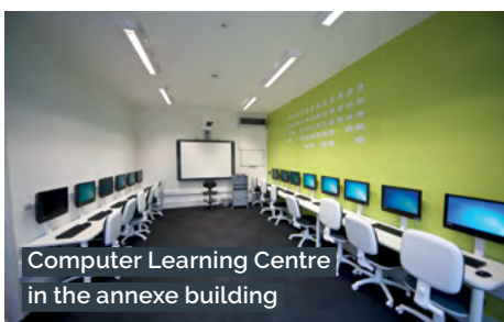
Computer Learning Centre in the annexe building