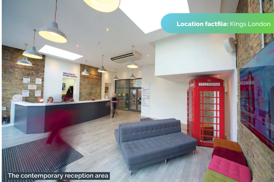
The contemporary reception area