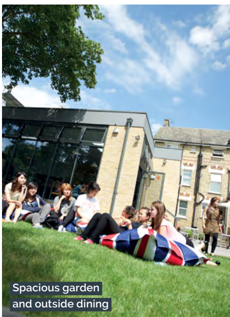
Spacious garden and outside dining