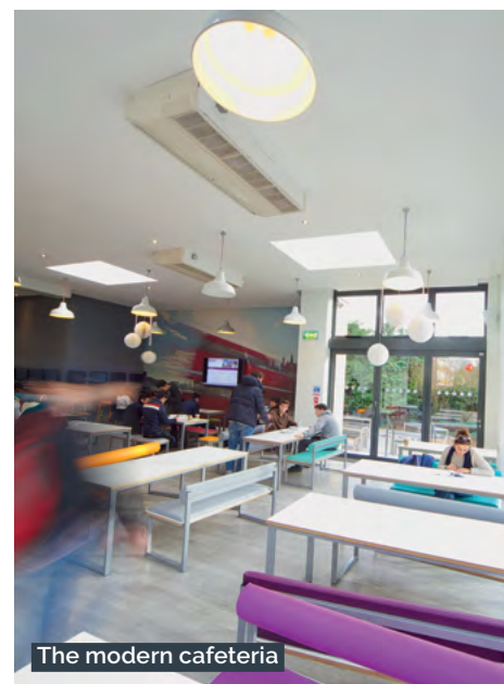
The modern cafeteria