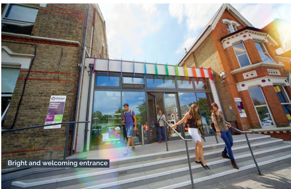
Bright and welcoming entrance