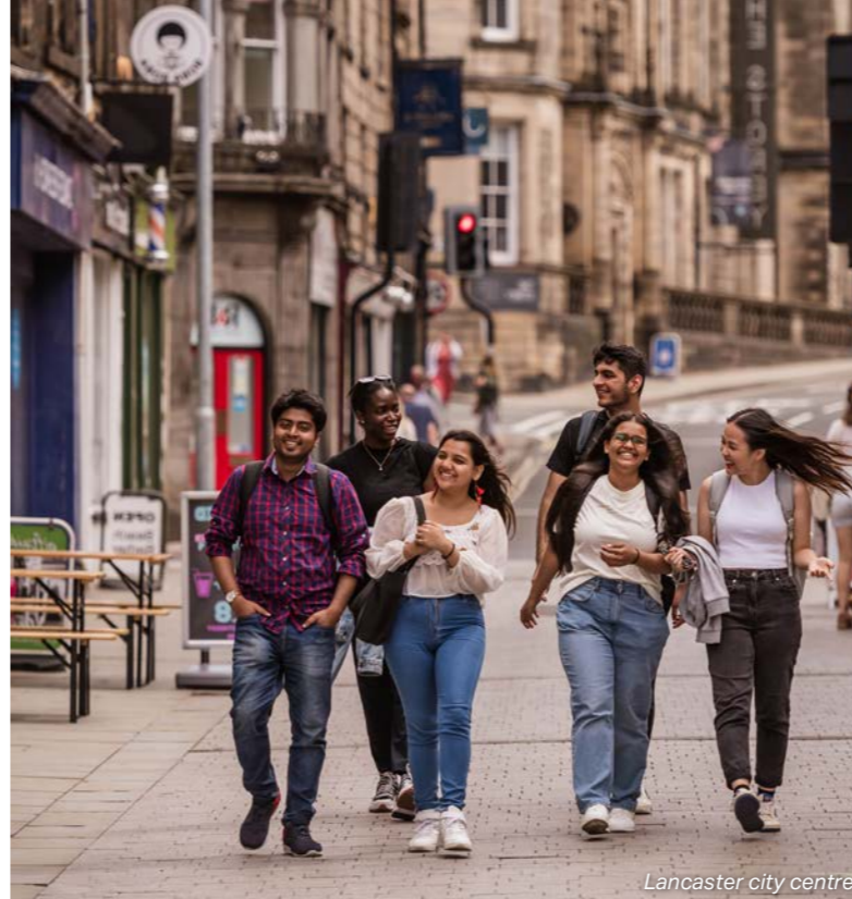
Lancaster city centre