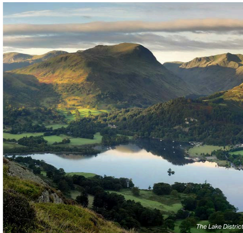
The Lake District