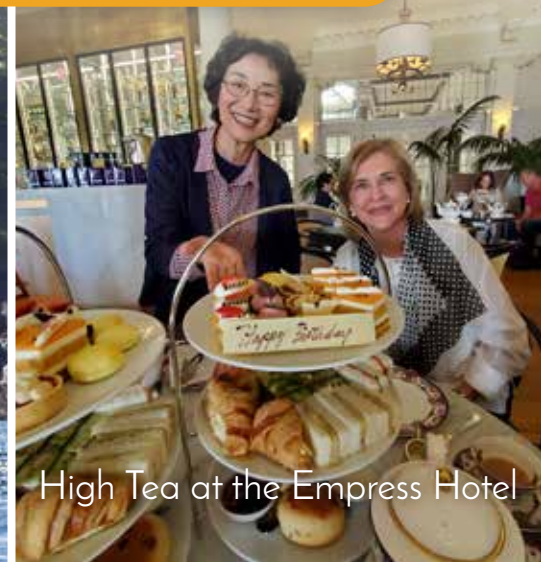
High Tea at the Empress Hotel