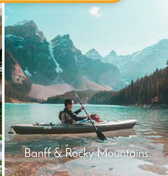
Banff & Rocky Mountains