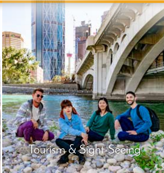
Tourism & Sight-Seeing