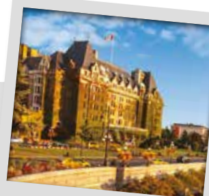
High Tea at The Empress Hotel