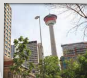
Calgary Tower and Walking Tour